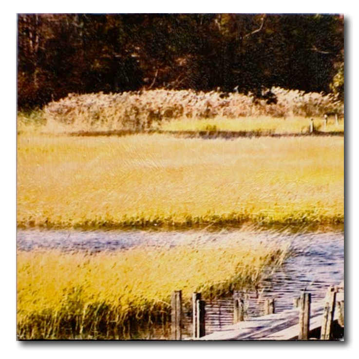
Golden Acre 12" x 12" 2007

Acrylic Paint for painting around the edges (not shown)