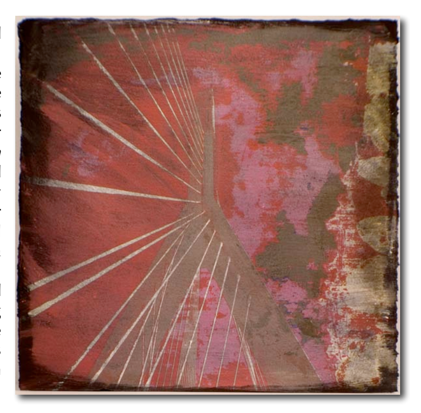
Zakim at Night 12" x 12 " 2007

Black painted paper with iridescent inkAID, then tape around the edges for printing. The curled paper and is taped down to a carrier sheet. The image Zakim at Night is printed and the tape is carefully removed. The carrier sheet is once again used as a template and as a method to print full bleed print over deckled edges without messing up the printer. The print setup and dialog is explained with screen shots.